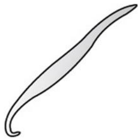
Hookworm (5x actual size)

Hookworms are intestinal parasites of the cat and dog. Their name is derived from the hook-like mouthparts they use to anchor to the lining of the intestinal wall. They are only about 1/8" (two to three mm) long and so small in diameter that they are barely visible to the naked eye.