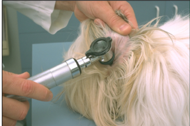
Otosopic exam of ear canal.

An important part of the evaluation of the patient is the identification of underlying disease. Many dogs with chronic or recurrent ear infections have allergies or low thyroid function (hypothyroidism). If underlying disease is suspected, it must be diagnosed and treated or the pet will continue to experience chronic ear problems.